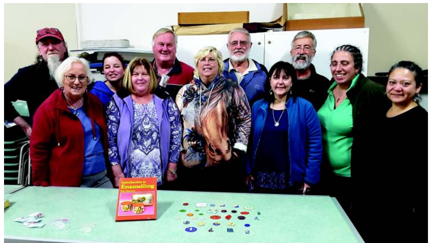
The Usual Suspects