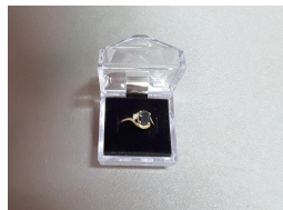
1 st Prize

Guessing Competition: EVERYONE NEEDS TO GET BEHIND THIS! Books can be collected from the front table at the Club House. Good luck with ticket sales, we have some great prizes. Everyone is encouraged to get a book. Remember this is our biggest fund raiser for the year and this is how you can help keep your Club remain fully equipped and maintained! Prizes: