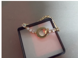
2 nd Prize