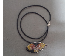
5 th Prize