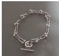
3 rd Prize