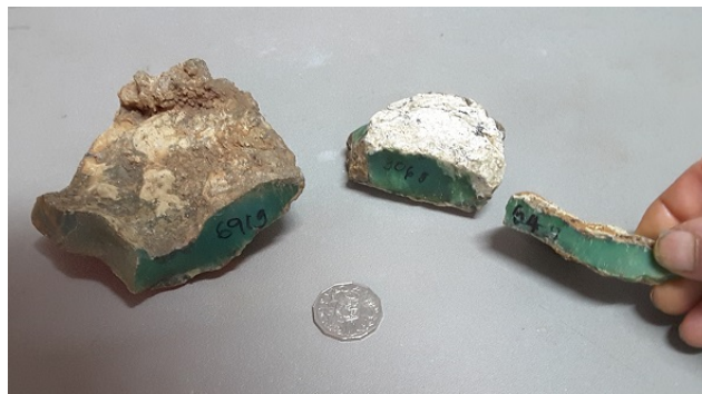
An example of the pieces

Some of the specimens will be on display at each business meeting until October.