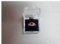
1 st Prize