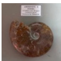
5 th Prize