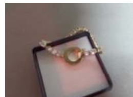
2 nd Prize