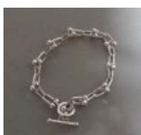
3 rd Prize 4 th Prize