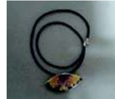
5 th Prize