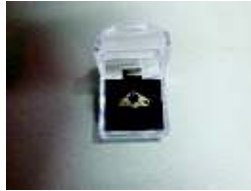
1 st Prize