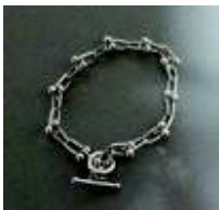
3 rd Prize