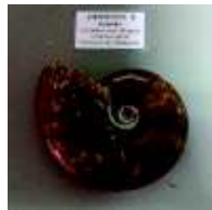
4 th Prize