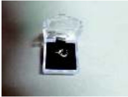
1 st Prize