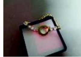
2 nd Prize