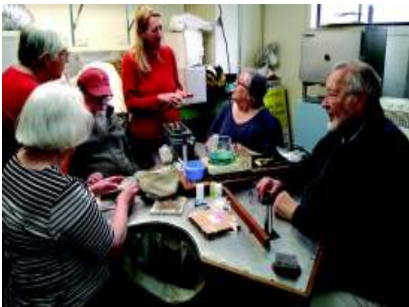
In the Silver room

What a delight it was to welcome her to our little club and to see her enthusiasm for our endeavours. A 15 minute visit for morning tea ran into several hours and a morning tea that approached lunchtime. She notes that her parents were into fossicking but, as she had reached adulthood moved on she never acquired the enthusiasm for this, jewellery however, is a different story. There is a promise to attend or exhibition and we have promised her that there will be a wide range to choose from. She is only too pleased to help with grants, can see why we do need them but has volunteered her staff will help us fill out the forms!