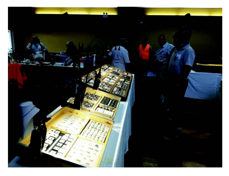
Sapphires and Opals - beautiful