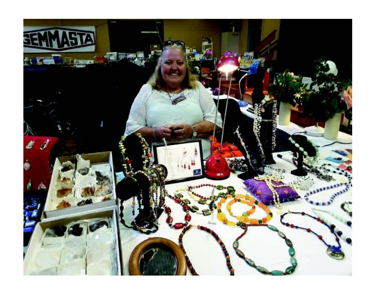
Sandy is just wild about the exhibition