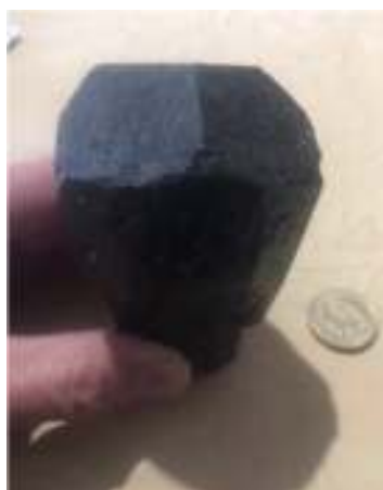
A couple of Tourmaline Grenades swapped for a couple of