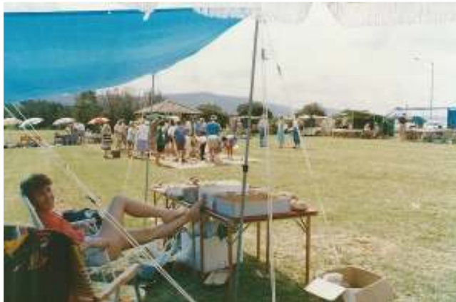
Guess who (with not so many tables) and the rock scramble happening in the background

Some photos of our 1992 Rock Swap at Stuart Park when things were not so serious and we all partook in games like Gumboot Throwing and Sack Races - those were the days . . . .