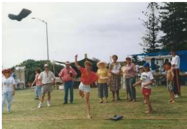
Gumboot throwing - at least it's going in the right direction!!!! Some old faces in the background.