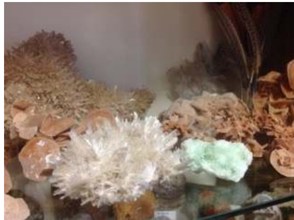
Dravite crystal. Given to me by a former member