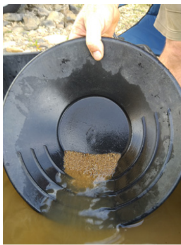
Oallen Ford 2020

With magnification there are specks of alluvial gold to be seen