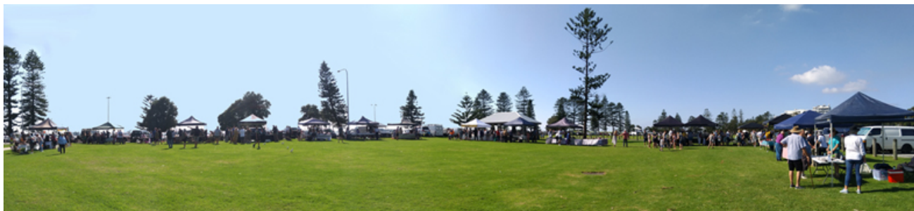
A Panorama of the Rock Swap

A little head pops up over the table and then looks longing at her mother. The little girl, only six years of age, has seen a Shark's tooth that she loves. Her mother looks at her and smiles. I pop the Shark's tooth in a bag and pass it to the little hands that await, they are clapping in anticipation. She takes the bag and is jumping on the spot unable to contain her joy and excitement and says thank you. The huge grin on that little face makes my getting up at 4am in the morning all worthwhile. The joy in that little moment was so, so precious. A future rock hound for sure.