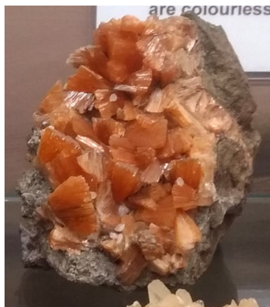
Figure 5. Heulandite Specimen

Heulandite is something else that can be found on the property, but not as easily as Drusy. Like Stellerite it is quite soft. It has a Mohs hardness of 3.5 – 4. Below is a photo of a very beautiful specimen that can be found in the Crystal Kingdom in Coonabarabran. I'm not sure if you can still find specimens like this on the property, but I'd sure like to find out!