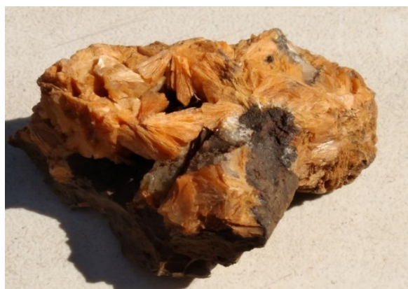
Figure 4. Stellerite

Figure 4 is an example of Stellerite. It is getting harder to find Stellerite that is in good condition. A lot of Stellerite that is on the surface has been damaged or has faded because it has been sitting in the Sun. If you would like to find a nice specimen, you will have to gently dig for it. It has a Mohs hardness of 4.5