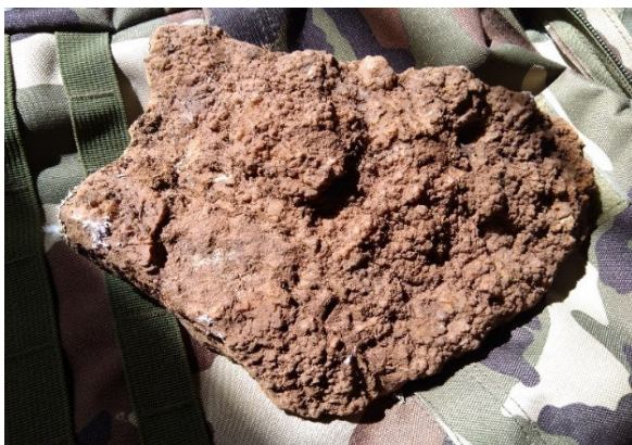
Figure 2. Dirty Drusy

Figure 3 shows you what some clean Drusy looks like, with some pieces it takes quite a bit of cleaning and some dirt is just stubborn and will unfortunately remain. If you would like to see your Drusy BLING, hold it in the Sun. It is a very beautiful site to see! It has a Mohs hardness of 7.