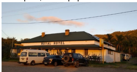
Figure 1 Tambar Springs Hotel 2018

In the past, it was popular for members to have stayed at the pub in Tambar Springs and a few in Coonabarabran. The pub was closed on and off for a time since 2019 and now has new owners and has had some renovations done. In 2019, it was the first time we were able to stay on site, while a couple of our members stayed in