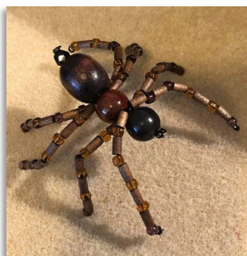
Some of Aira's cute creations for the club table at the end of year exhibition.