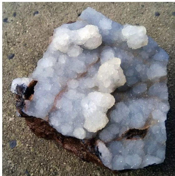
Figure 3. Clean Drusy

Figure 2, shows a piece of Drusy that has come out of the ground. It is caked with dirt and the Drusy can't really be seen. Some Drusy you find on the surface can be partially clean, have Lichen growing on it, or still be caked with dirt, so much so, that you might miss it altogether. You won't really know what it looks like until you clean it and a lot of the time, cleaning occurs at home.