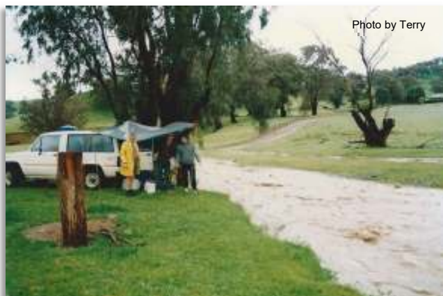
The water kept rising, the camp kept moving! Flood Waters of Muttama - 1990