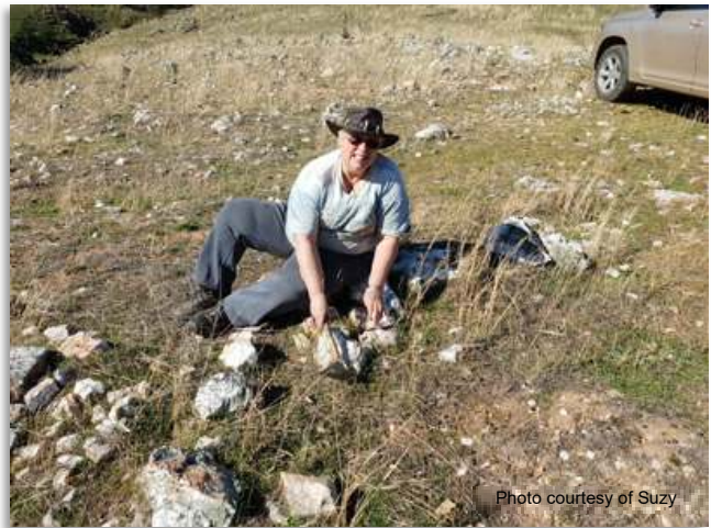
Suzy ready to start digging - 2018