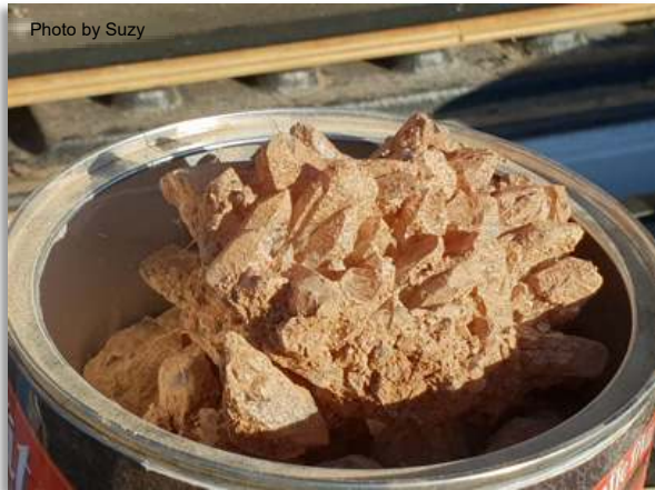
Suzy and Don's freshly dug crystals