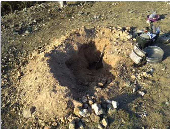
I hope there are crystals at the bottom of that hole!

The first time I went to Muttama I specc'd a nice crystal on top of the hill, it was full of lovely fractures which gave a rainbow spectrum of colours when the light hits it at the right angle. Ever since I have been searching for the source of the rainbow crystals, but I have been back three times now and still haven't found it. Last trip I dug a hole slightly downhill from where I found the first crystal and found several more rainbow crystals but they were all floaters. The nicest crystal point I had made into a silver necklace. It is about 5cm long and very sparkly bling, the picture doesn't do it justice. - Dron