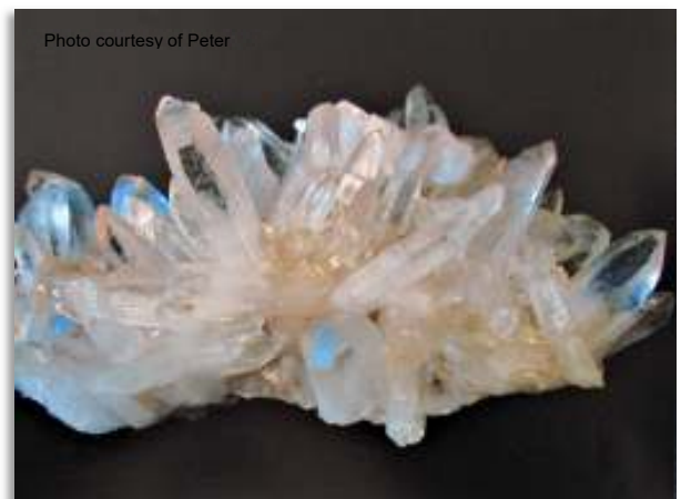
Muttama crystal cluster 22cm long – WOW Peter!