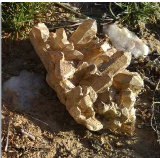
Crystal plate just out of the ground

Below, we have a crystal plate that Dave and I found at the bottom of a hole. The left is how it came out of the ground and the one photo on the right is the same crystal half cleaned. First it was soaked and cleaned, now it needs an acid bath to hopefully remove the staining. You can also see in the photo on the right, that a rather significant looking crystal (top right) came off during the cleaning process. You never really know what a crystal will be like until you clean it. For some, that will be in about 20 years haha (I bet some of you are nodding 🤔).