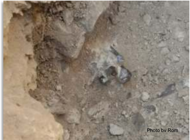
Crystals in situ - 2020