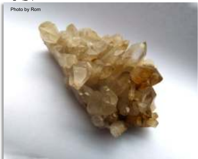
Crystal plate in the process of being cleaned.