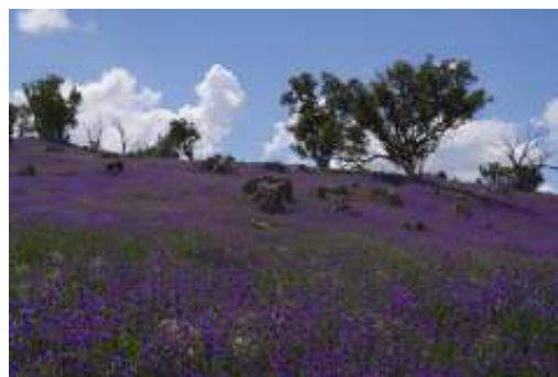
Paterson's Curse - 2020

Unfortunately, the noxious weed had covered all of the paddocks, the problem this caused was a) if you have hayfever and you have forgotten your tablets, you are in for a weekend of not breathing properly, brain fog and sneezing, lots of sneezing. If you don't have hayfever, carry on, nothing wrong here, unless, b) you have to drive over the Paterson's Curse, it is very, very slippery. So slippery in fact, that during our “recon day”, one of our members had a minor slide backwards down the hill and had to be “winch started” up the hill, which he was able to successfully get up. We took a different way the next day when the rest of the group turned up. When it was time to leave, you could most certainly notice that you had escaped left Paterson's Curse territory , the sinuses cleared, the brain fog lifted and the hills were no longer alive with the sound of my sneezing!