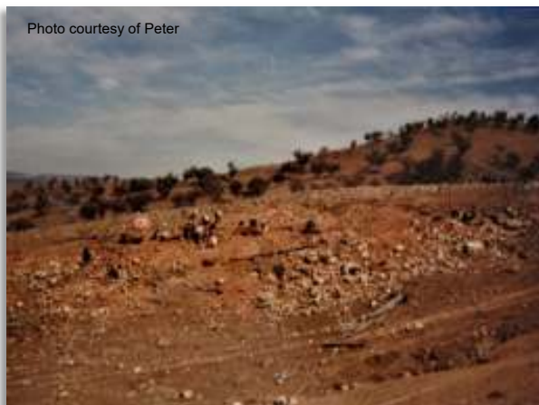
Fossicking on the hill around 2010 -- much digging