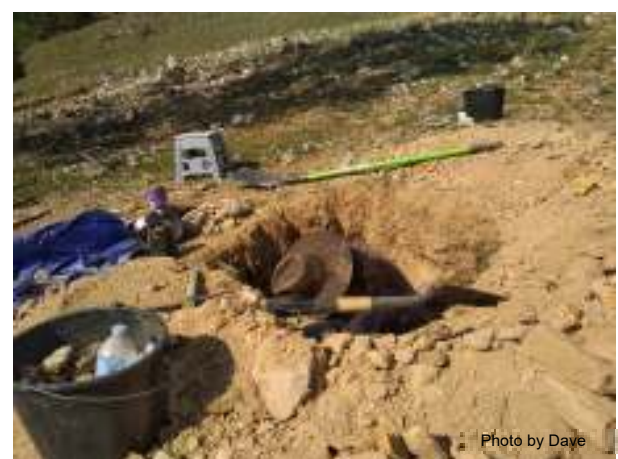
Rom disappearing down the hole - 2019