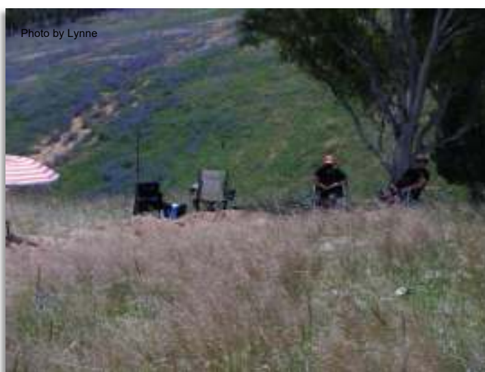
Rom and Dave, waiting for crystals to grow - 2020