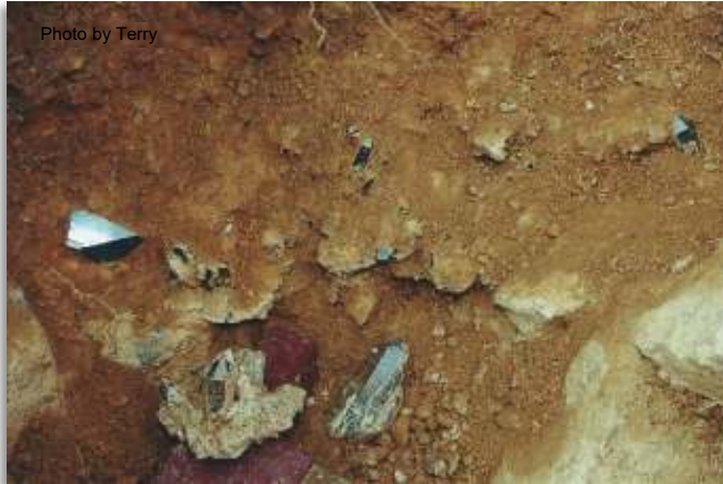
Crystals in situ - 2000

Even though you are using some ground breaking tools to dig a hole like the one below, you need to be very careful when you get down to the “nitty gritty” of things, if you are too rough and not paying close attention, you might damage some of the crystals that begin to poke out of your hole. Below we have some crystals just starting to show, this is where some delicate fossicking is required. These photos were taken 20 years apart.