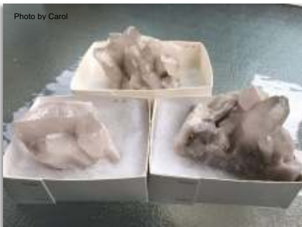
Beautiful, clean crystals from Carol n Bob