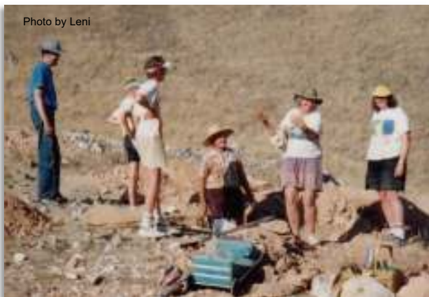
Looks like a winner! - 1990