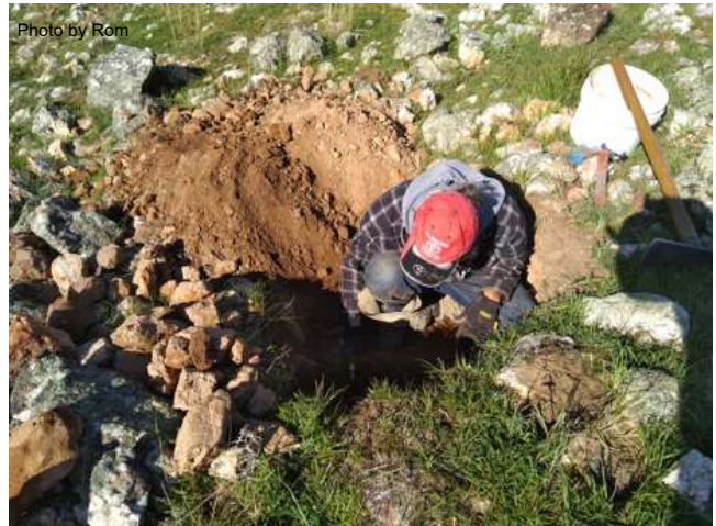
Dron busy digging - 2019