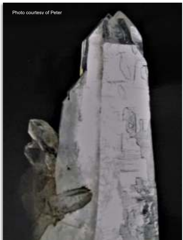
An amazing 10cm crystal from Muttama