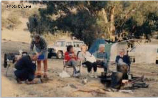
Camping - 1995