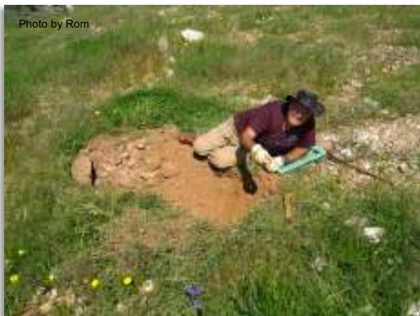
Greg getting down and dirty! - 2020